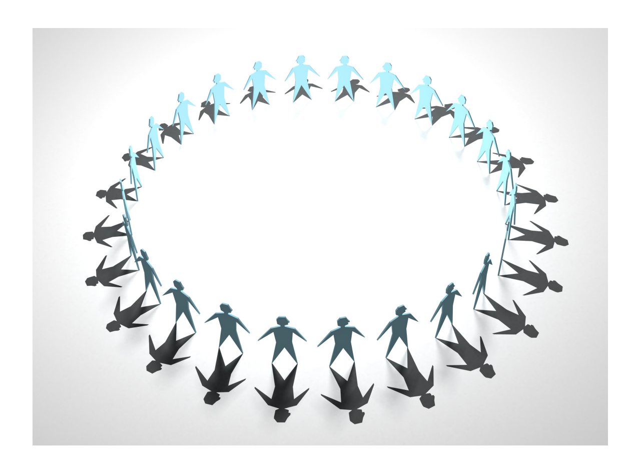
Bringing The Best Out Of The Worst People The Guide To Motivating Others And Getting Results With Anyone

everything that they do. And, on the way, you will also see why it is important to motivate people in the first place.